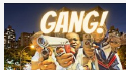
Hey Gang, Why Would I? (Gang Training)