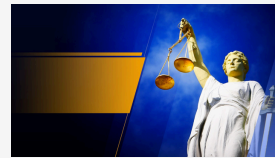
Navigating the Court System