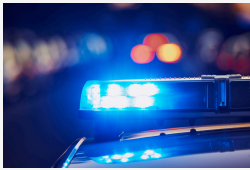
Interaction with police