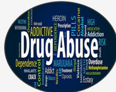
We Talkin' 'Bout Drugs